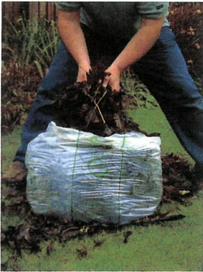
Filling a bio-polyester bag