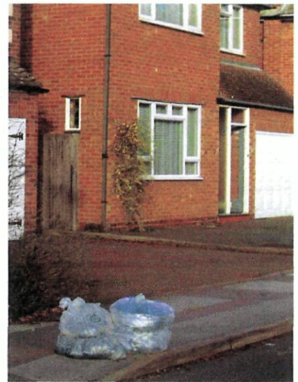
Kerbside collection point

residue. Although paper belongs in this category, the lifecycle for a cradle-to-grave process involving trees is a discussion point, not to mention the significant chemical processing necessary to manufacture the paper.