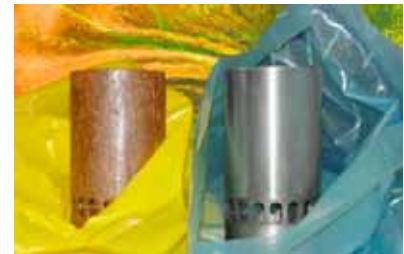
Photo depicts part packaged in plain PE film (left) and part protected with Cortec® VpCI® 126 BIO (right).

Protection is easy. Simply package the part with 126 BIO and parts will remain corrosion-free for up to five (5) years. No special techniques or proprietary equipment are required. Normal manual and existing automated equipment can be used for packaging. The translucent BIO film allows visual inspection of parts without opening the package. Because parts receive clean protection, they are ready for immediate use. Simply open the package and install the part. No cleaning or degreasing is required, again saving chemical and labor costs.