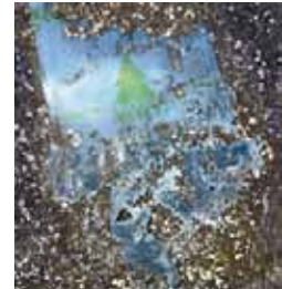
Degradable 126 BIO

The world's most advanced and widely utilized packaging films (83 countries), Cortec® VpCI®-126 Blue is now available in a 100% Degradable version. Conventional Packaging PE film can take centuries to degrade if ever. In contrast, when 126 BIO film comes into contact with organic materials during disposal, its microbial activators start the process of degrading the film into basic organic elements such as water and carbon dioxide. VpCI® 126 BIO degrades in less than five (5) years, is recyclable, and meets MIL-B-22019-C and MIL-B-22020-C.