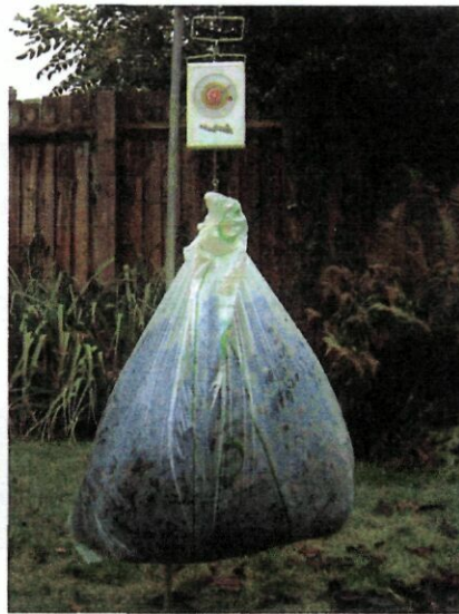
Garden compost is often very dense