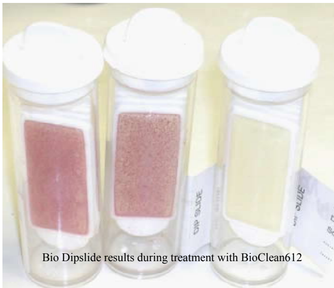
Bio Dipslide results during treatment with BioClean 612